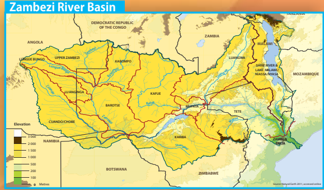
Figure 1:The Zambezi River Basin and Riparian States

In the context of the of the ZAMCOM Agreement, the Strategic Plan for the Zambezi Watercourse is defined as a, ".....development plan comprising a general planning tool and process for the identification, categorization and prioritization of projects and programmes for the efficient management and sustainable development of the Zambezi Watercourse"