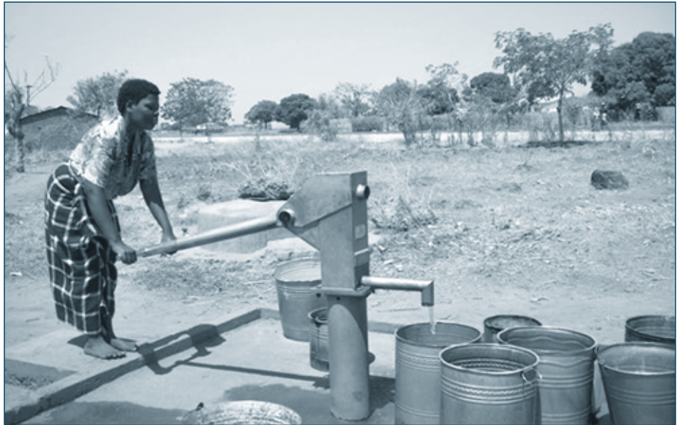
The distance walked to access water has been reduced through the drilling of boreholes.

The small-scale irrigation schemes are at various stages of development in the seven districts. These are: Lusitu in Siavonga, Buleya Malima in Sinazongwe, Nkolongozoya in Gwembe, all in Zambia. In Zimbabwe, the irrigation schemes are at Gatche Gatche in Nyaminyami, Mlimbizi in Binga and Chitenga in Hurungwe.