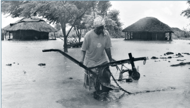
Southern Africa has experienced severe floods, resulting in destruction of infrastructure and homes.

Ironically, the downpour compounded the challenges of a severe drought that caused Botswana, Malawi and Zambia to declare a state of disaster as hunger threatened.