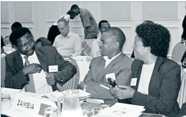
Participants attending stakeholder dialogue networking conference, Gaborone.