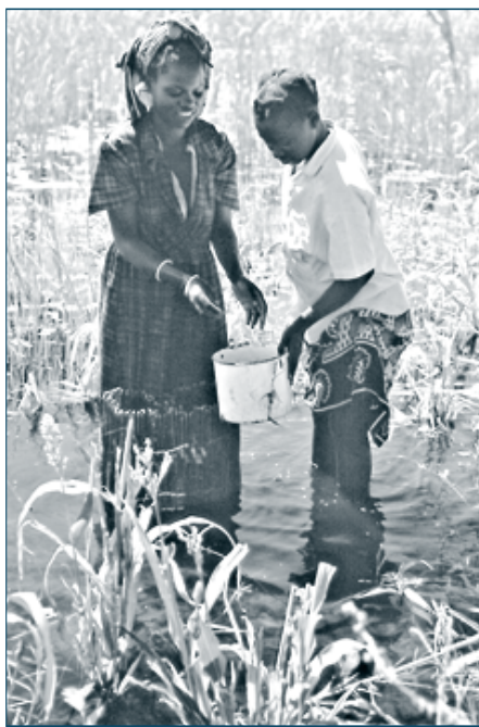
Wetlands have provided many ecological and social services.

Ramsar sites found in the Zambezi basin include Kafue flats and the Lukanga and Bangweulu swamps in Zambia. The Okavango Delta System in Botswana include the Okavango river, Lake Ngami and parts of the Kwando and Linyati river systems that fall west of western boundary of the Chobe national park. In Malawi, the entire Lake Chilwa is within the basin.